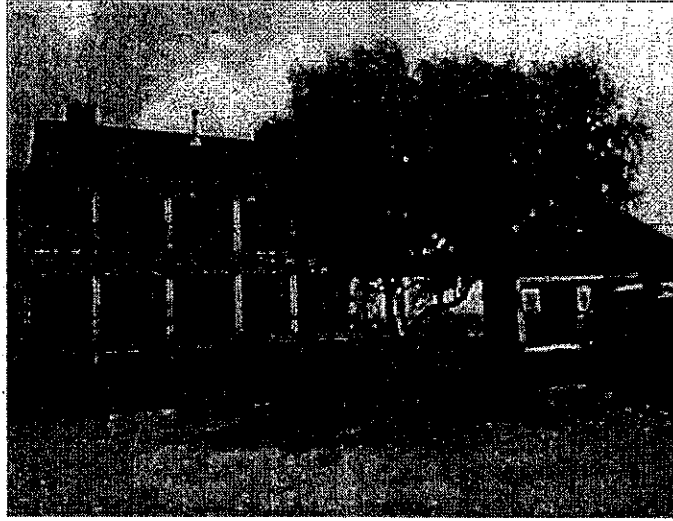
FRONT VIEW 8/14/2006

If using the Elevation Certificate to obtain NFIP flood insurance, affix at least two building photographs below according to the instructions for Item A6. Identify all photographs with: date taken; "Front View" and "Rear View"; and, if required, "Right Side View" and "Left Side View." If submitting more photographs than will fit on this page, use the Continuation Page, following.