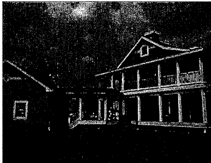
RIGHT VIEW 8/14/2006