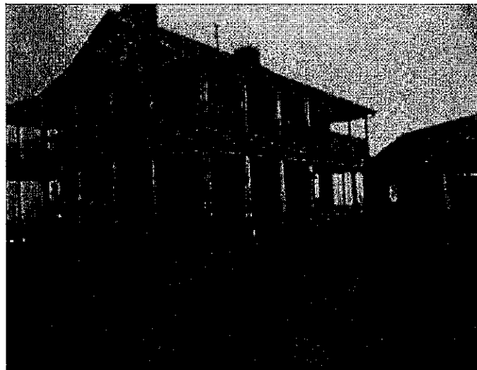
LEFT VIEW 8/14/2006